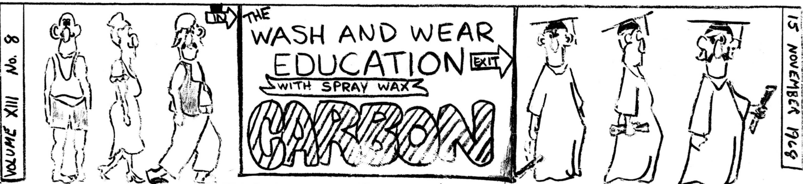
WHAT'S HAPPENING AT MC OR THE VAS WAISTLAND