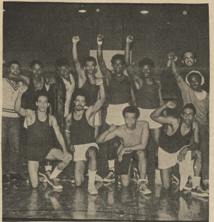
1969-70 INTRAMURAL BASKETBALL CHAMPIONS are the Jwan-tu-Wjazuri .

The Doyle Hall Film Series will sponsor Doctor Faustus Friday at 8 p.m. The color film, directed by Richard Burton and Nevill Coghill, stars Richard Burton, Elizabeth Taylor, and the Oxford University Dramatic Society. Admission is $.90.