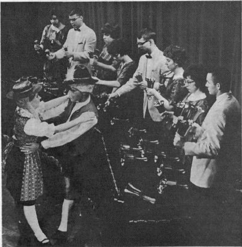
COSTUMES accentuate the atmosphere of gaiety as Spartan Bell Ringers chime a novelty number.