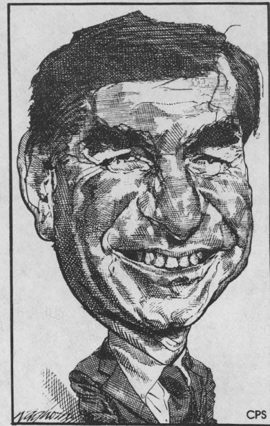
MICHAEL S. DUKAKIS

Carbon meetings are held each Monday at 8:30 p.m. in the Student Board Conference Room. You are welcome.