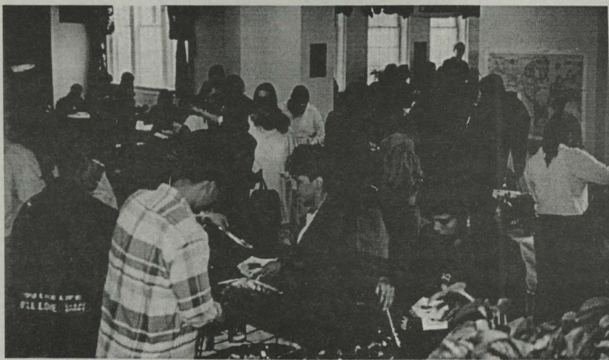
Tasting the Nations