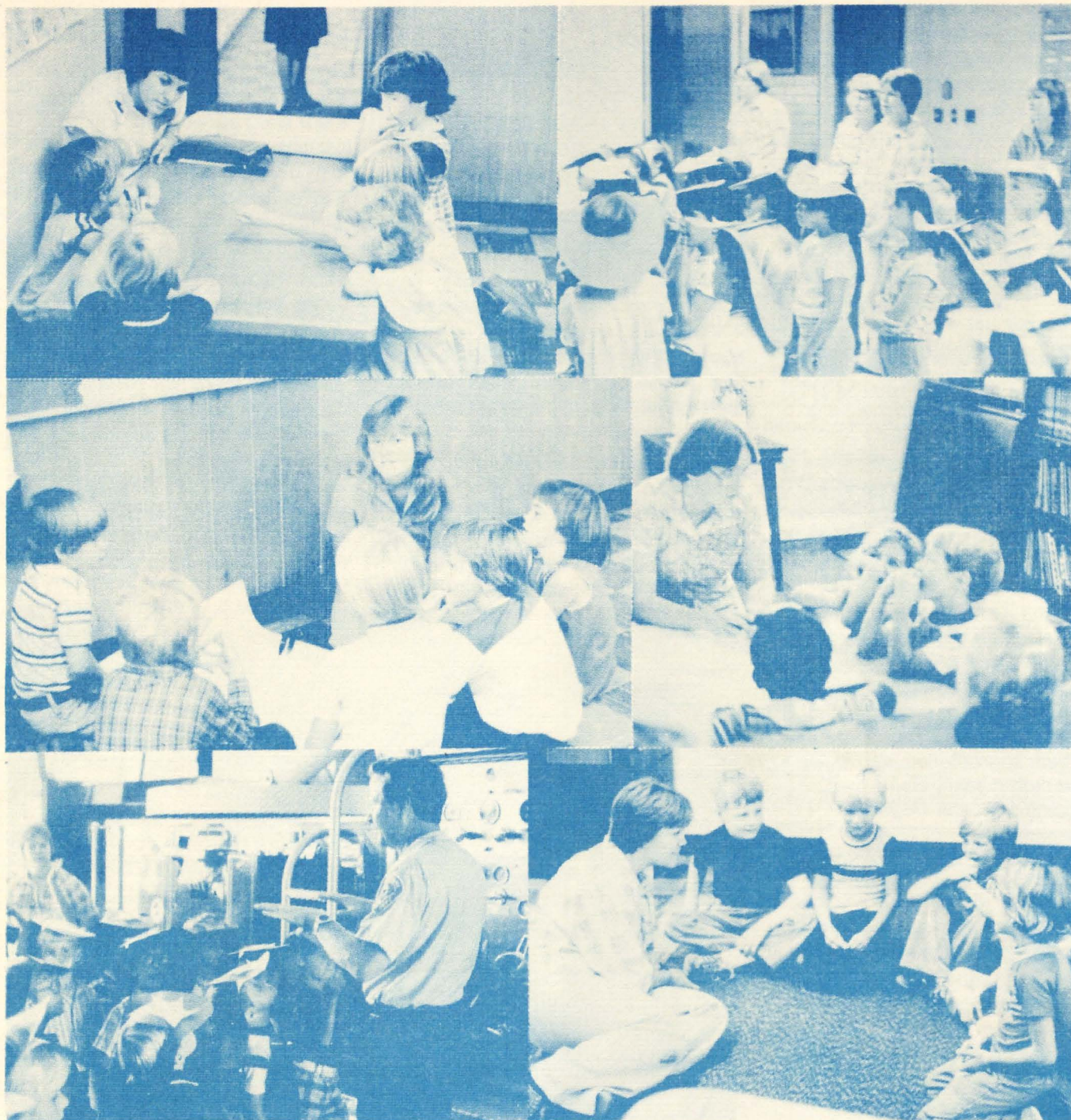
EDUCATION MAJORS AT ST. CHRISTOPHER'S SCHOOL, INDIANAPOLIS

Marian College Library Indianapolis, Ind.