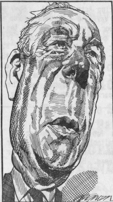
Secretary Of State GEORGE SHULTZ

Remember, a little drinking, a little night life does the soul good. Stay well, but don't stay sober.