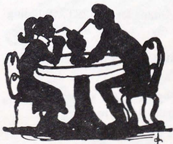
FRESHMAN SODA SHOP Thursday night in the Perc