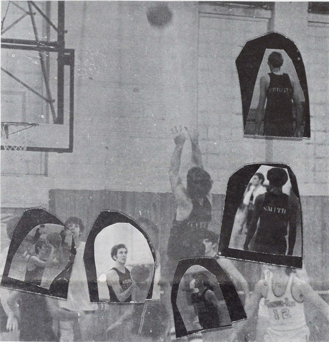
Amid the background of one of their preseason games are some of the returning Knights. The Knights have been preparing for the exciting season ahead for several weeks now and will meet the Marion Titans this Saturday.