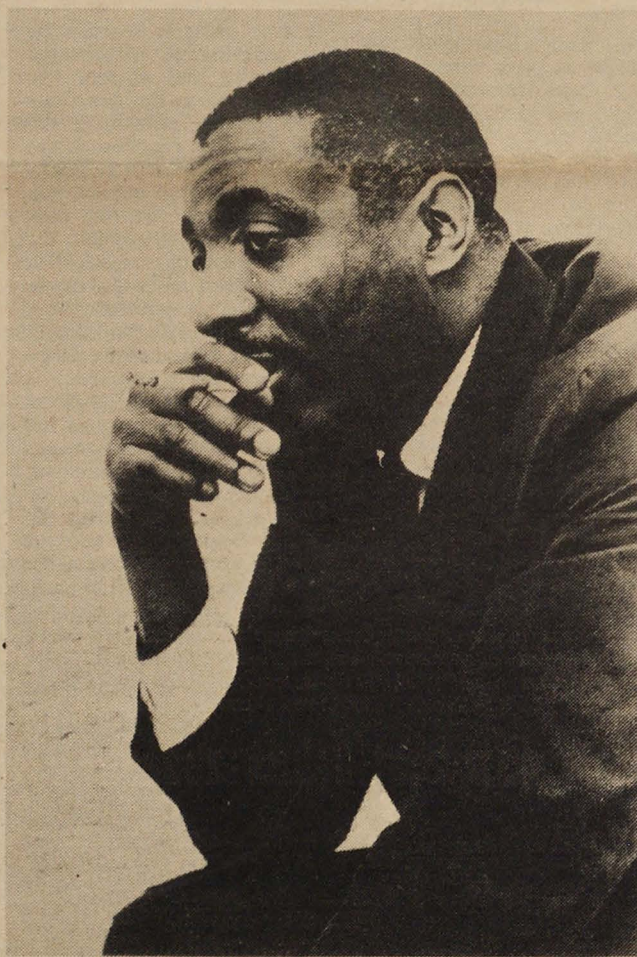
Comedian Dick Gregory, now a civil rights advocate, will speak on the controversial issue at a convocation in the Marian Hall Auditorium, Thurs., March 27 at 12:30 p.m.