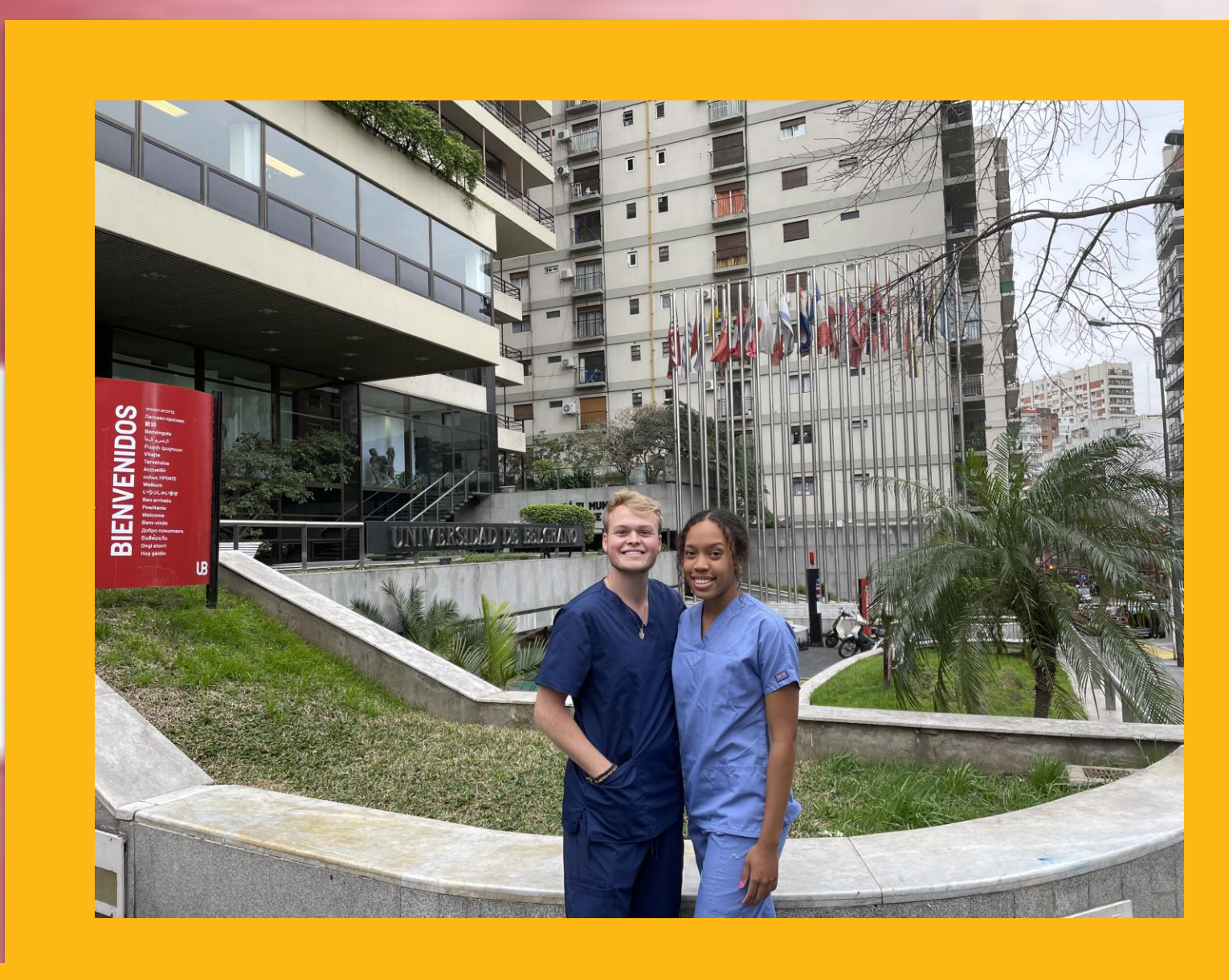
"No llevan tus ambos afuera de la clínica porque la gente va preguntarte por ayuda."