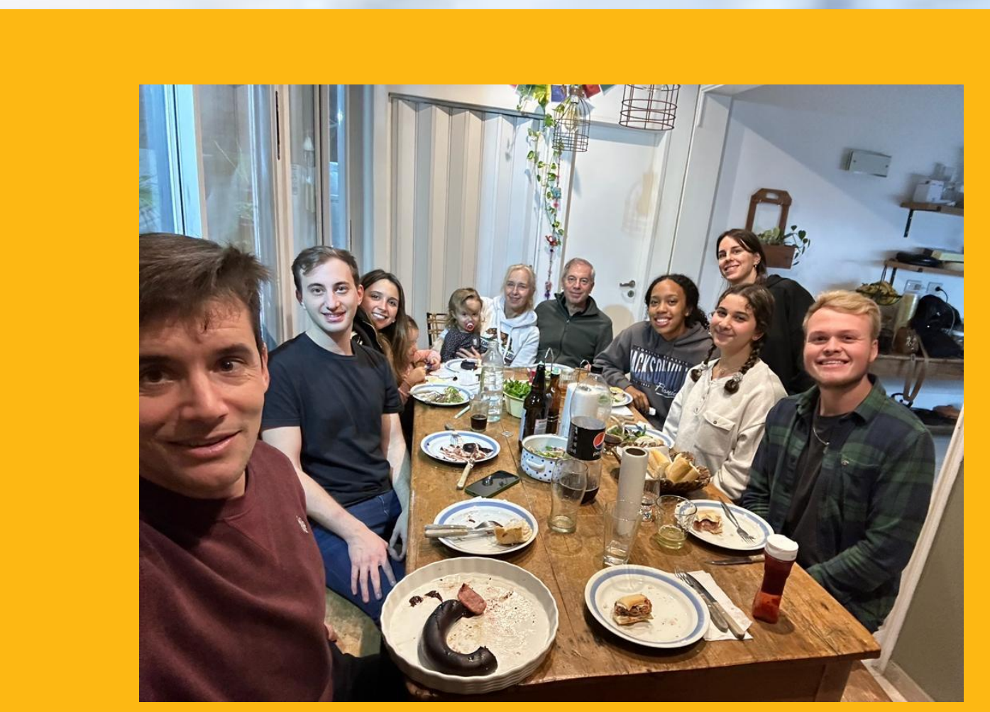
"Las mejores cosas de la vida están destinadas a ser compartidas."