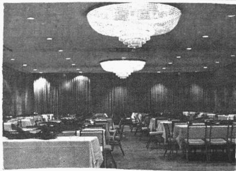
Cole Porter Ballroom: This year's site of Sweetheart's Ball

Since the hotel is in downtown Indianapolis, not only the facilities of the hotel, but those of numerous restaurants in the area will be available to those in attendance for pre-dance or post-dance dining enjoyment.