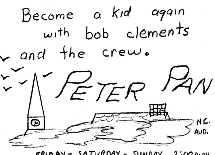
FRIDAY - SATURDAY - SUNDAY 2:00 p.m. SUNDAY ONLY 8:00 p.m.