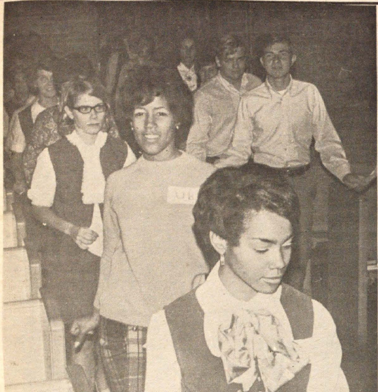
Students enter the Chapel for Midnight Mass by dancing down the aisles. The Mass followed the UBI mixer.