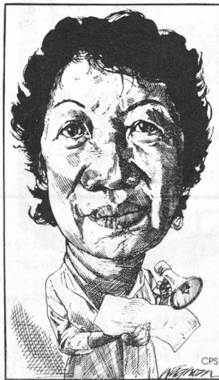
Presidential Candidate CORAZON AQUINO

The students are alerting all members of the Board of Trustees to the reaction of the