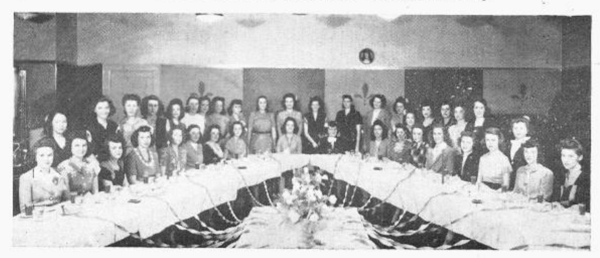
Lined up for a camera record of a big event are the sophomores, just before the class banquet Apr. 12.